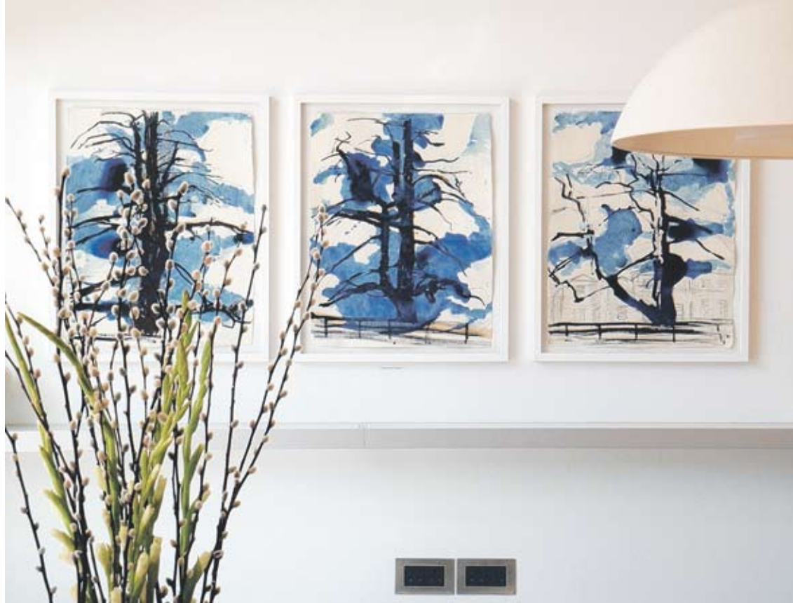
BACKS TO THE WALL: No Naked Lights by Roy Pickering, left; Workshop Tree Tryptic by Roy Pickering, above; Space around a painting is extremely effective, below left; Beyond the Light of the Sun by Sara Brighty, below right.